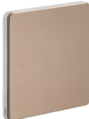
Prestige Black labeling