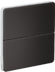
Magnesium White labeling