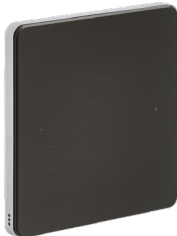
Jet Off-white labeling