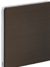
Vintage Off-white labeling