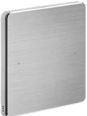
Aluminum Black labeling