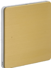
Gold Black labeling