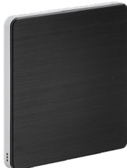
Noir Off-white labeling