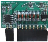
BZ-I Dry contact input card (for connecting with a Technical parameters third-party panel)