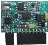
BZ-T Clock input card